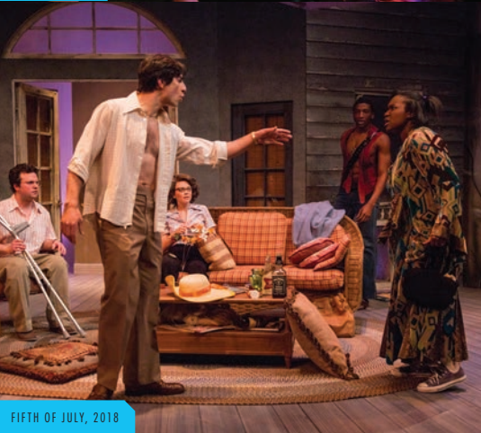
FIFTH OF JULY, 2018