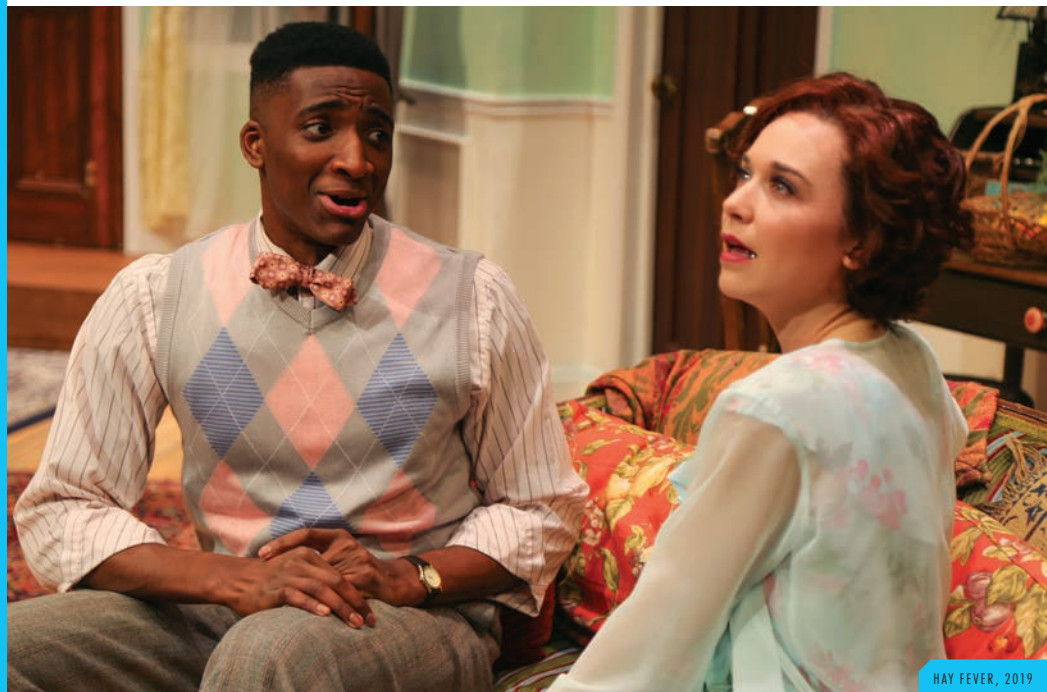
HAY FEVER, 2019