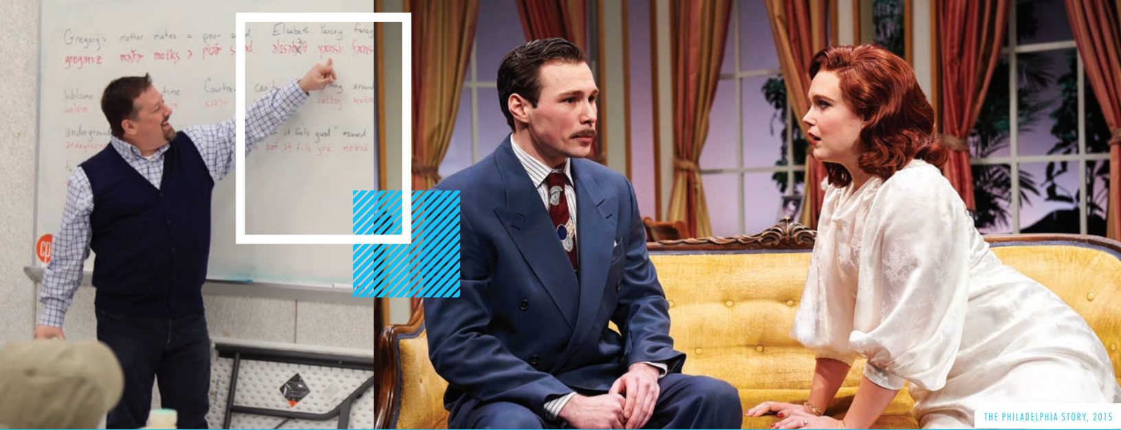
THE PHILADELPHIA STORY, 2015