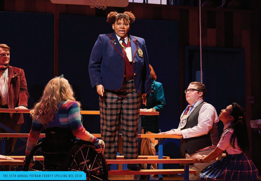
THE 25TH ANNUAL PUTNAM COUNTY SPELLING BEE, 2018