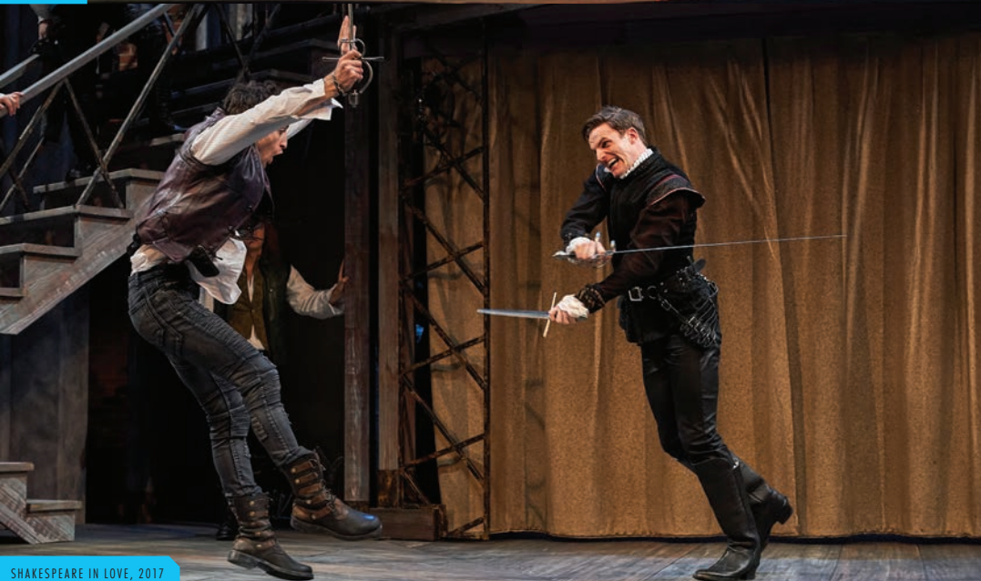
SHAKESPEARE IN LOVE, 2017