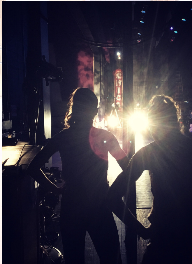
Left: 2019 Interns and Staff sell merchandise, Center: Backstage at the MVPAC in 2019, Right: 2019 Community Class